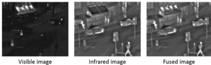
Figure 3. Different images.